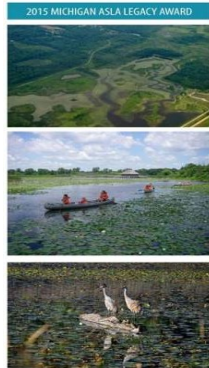
2015 MICHIGAN ASLA LEGACY AWARD